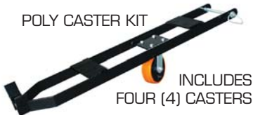
INCLUDES FOUR (4) CASTERS