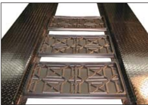
FOUR (4) DRIP TRAYS